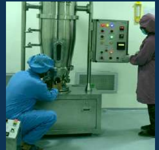
Finished Product Testing