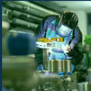
In Process Testing